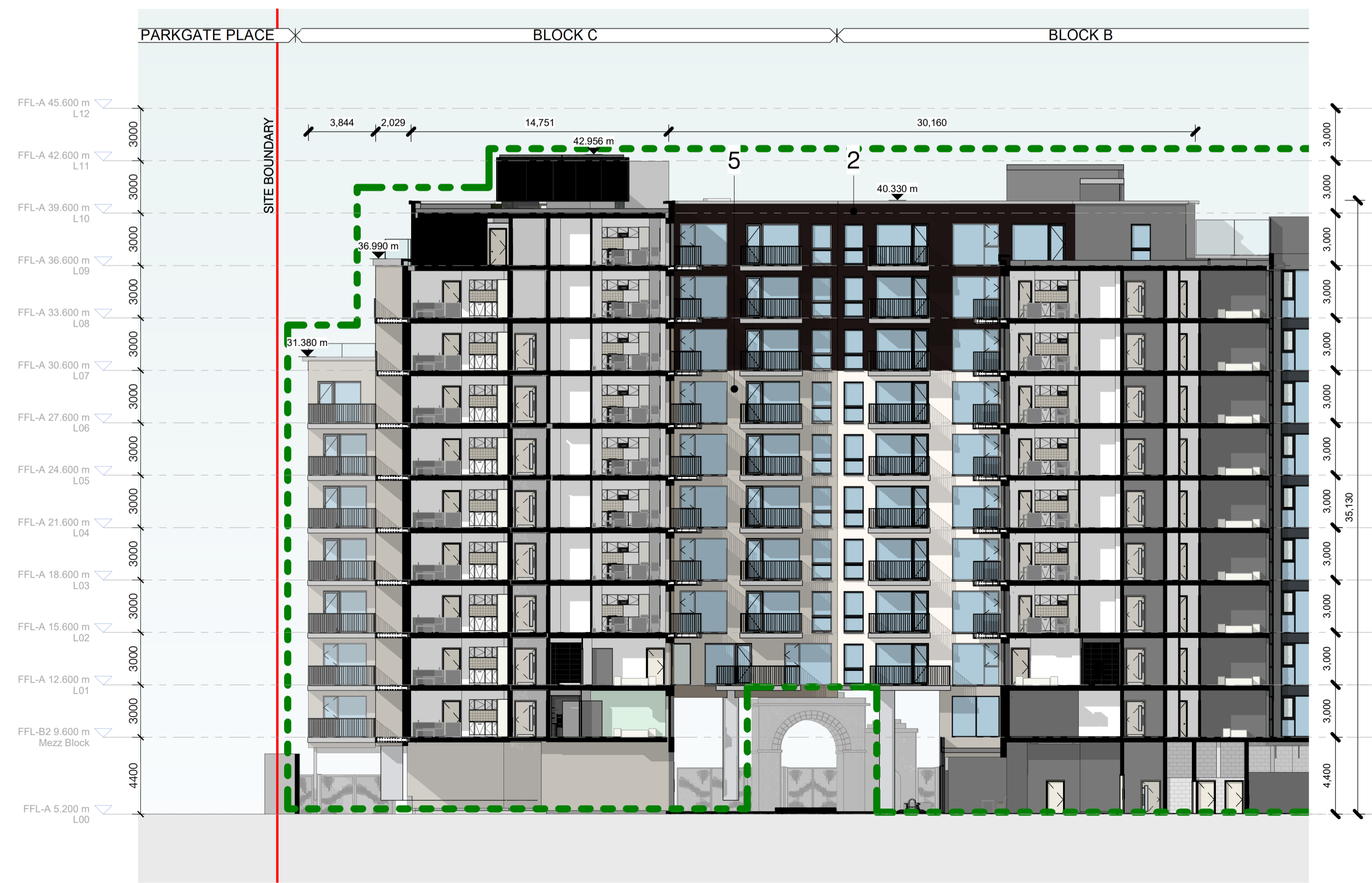
Block B+C - Proposed South Courtyard Elevation 1 : 200

Notes: - Do not scale from this drawing. Use figured dimensions in all cases. - Verify dimensions on site and report any discrepancies to the Architect immediately. - This drawing is to be read in conjunction with the Architect's Specification. - © This drawing is copyright and may only be reproduced with the Architect's permission.