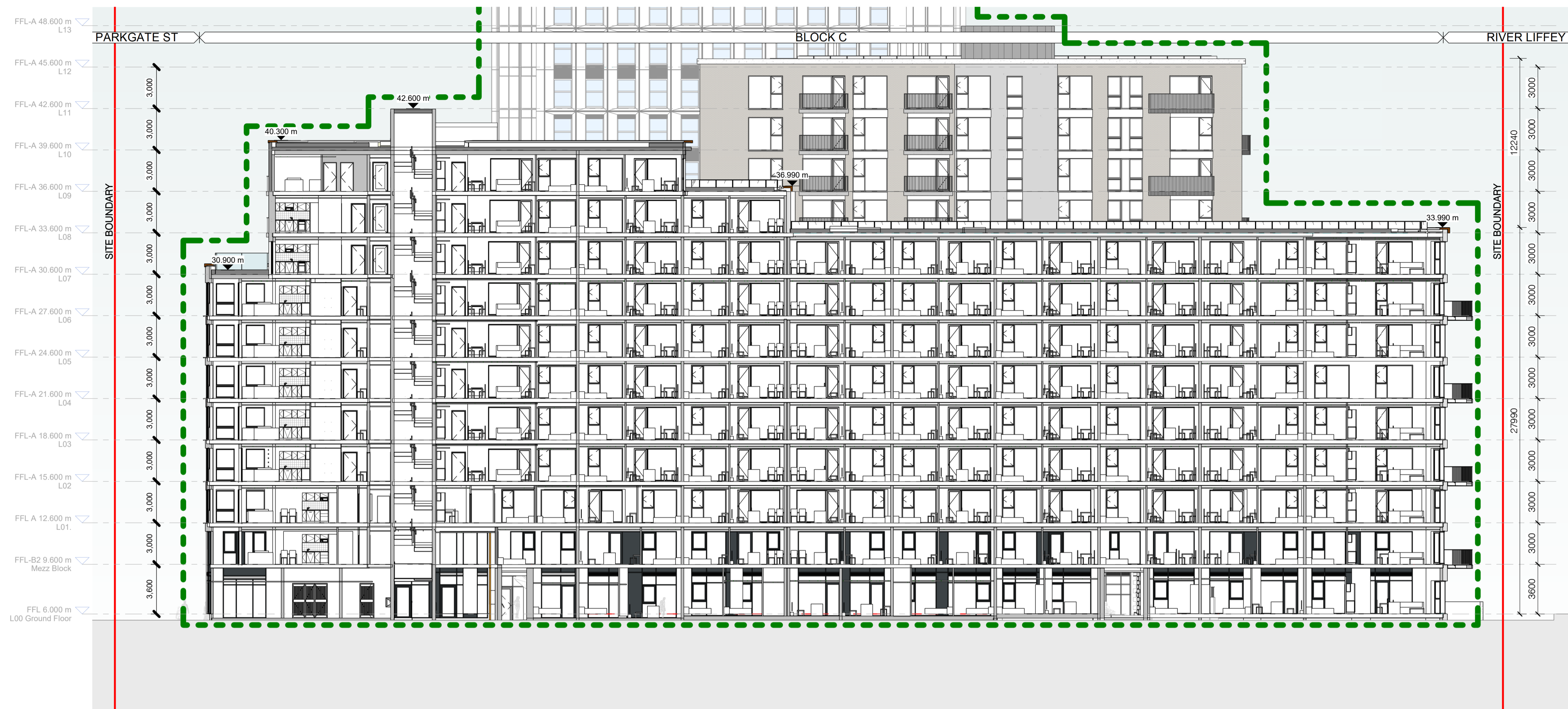
Proposed Section Block C 1-1 1 : 200